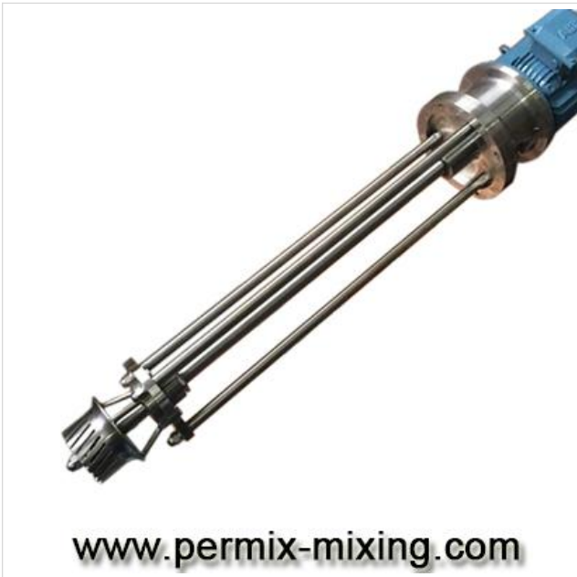
Standard PJ Mixer