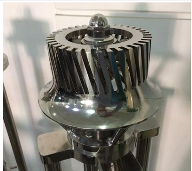
PJ Stator with Slot Opening