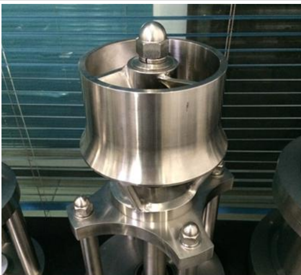
PJ Stator without Opening