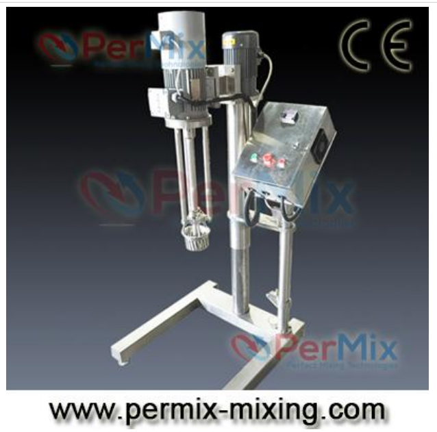
PJ Mixer on Electric Lifting Stand